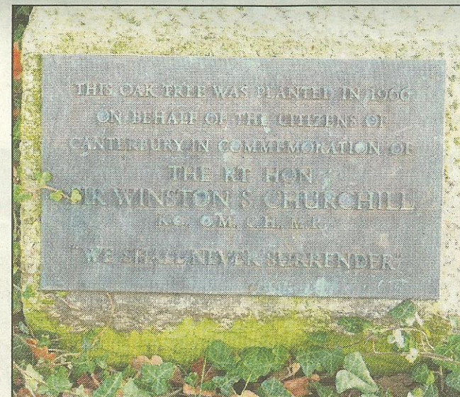
GREAT MAN REMEMBERED: The plaque for Sir Winston Churchill