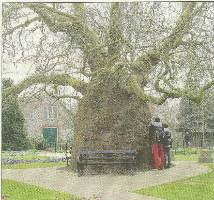
STRIKING: The mighty plane tree in Westgate Gardens impresses all those who come to look at it

How come we have five versions of the same tree, all showing signs of the same viral infection? One likely source is the Victorian