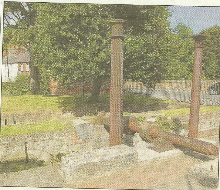
TODAY: Two pillars and a spindle can be seen on the site of Abbot's Mill before it was destroyed by fire