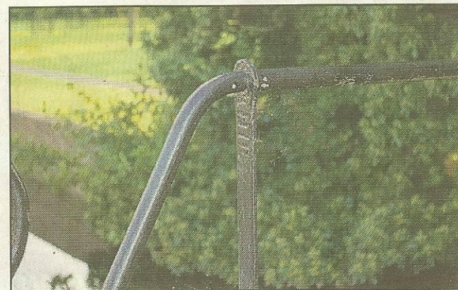
JUST THE SHAPE: Blacksmith's fullering marks seen on the weir

See if you can make out the text carved on the horizontal and vertical sides of the stone. This Abbot's Mill stone is still in use with an equivalent modern role. Serco staff now operate the weir paddles on behalf of the city council. If river levels fall below this stone, those running tourist boat trips find their craft scrape on the bottom of the water channel, and ask for reduced water flows through the sluices to keep the levels up. If levels rise above the stone, Environment Agency staff, who are concerned about threats of flooding, ask for an increase in the flow of water through the weir. Secondly, look for the small horizontal stones set in